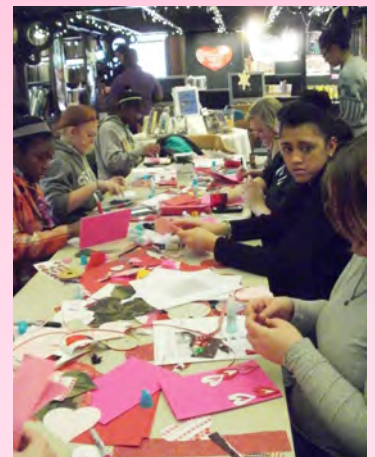
Above: Teens making Valentines for Vets in 2013.