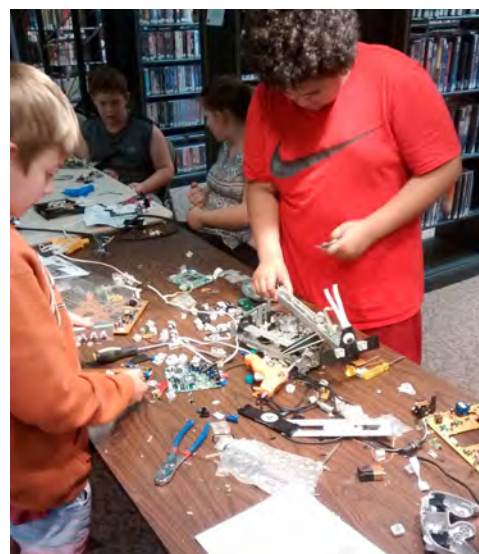
Above: Teens and Tweens work on creating insects out of E-waste at the Downtown Library's Creative Art Club.